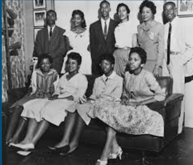
Little Rock Nine