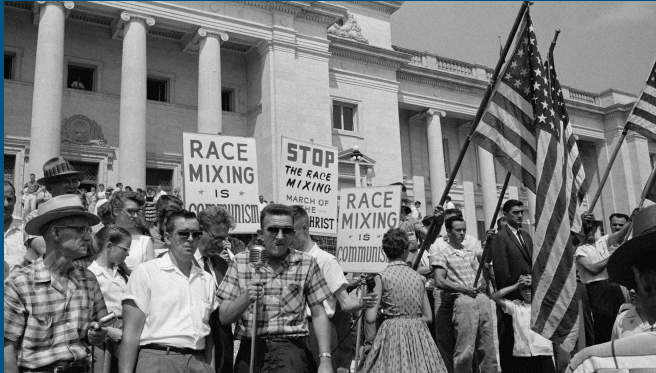
Resistance to Brown v. Board of Education