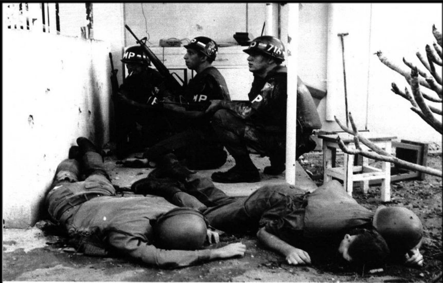
Three American military police kneel behind a wall at the entrance to the U.S. consulate next to the U.S. Embassy. In the foreground lie the bodies of two Americans killed in earlier fighting.