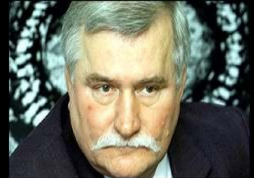
“Solidarity’s” Lech Walesa