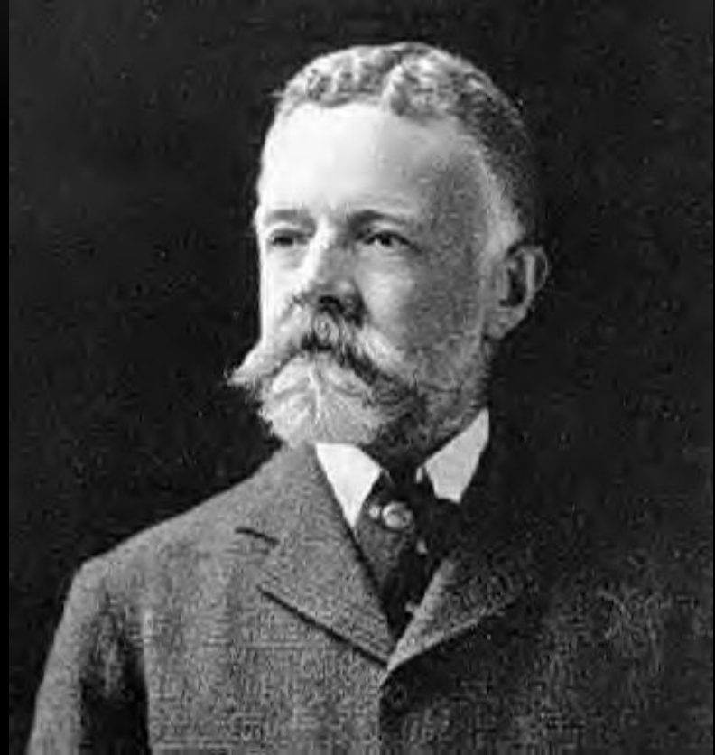
Henry Cabot Lodge

"THE UNITED STATES IS THE WORLD'S BEST HOPE, BUT IF YOU FETTER HER IN THE INTEREST THROUGH QUARRELS OF OTHER NATIONS, IF YOU TANGLE HER IN THE INTRIGUES OF EUROPE, YOU WILL DESTROY HER POWERFUL GOOD, AND ENDANGER HER VERY EXISTENCE."