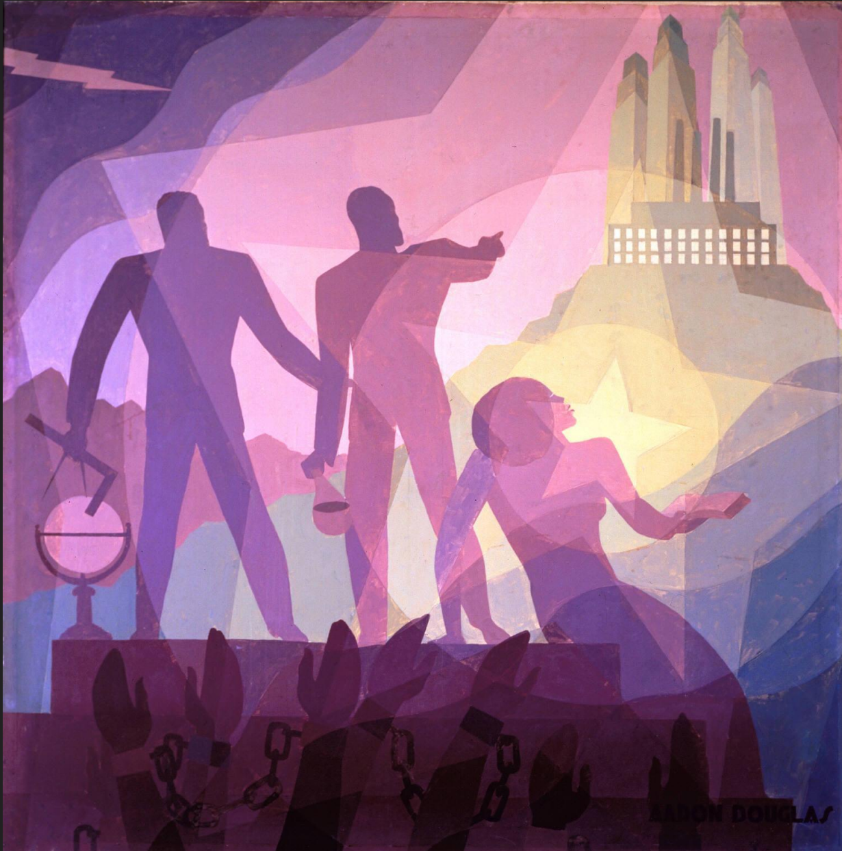
Aaron Douglas, Aspiration , 1934.